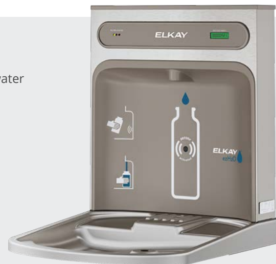
LZWSRK - Retrofit Bottle Filling Station Kit

The ezH2O retrofit kit can be installed on existing Elkay water coolers. Rough-in replacement allows replacement over existing plumbing and electrical lines for a hygienic and refreshing hydration solution.